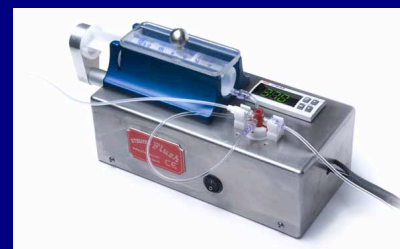
Pulsatile FSH Pump